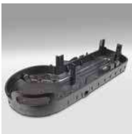
Redesigned composite drain pan is stronger with beefed-up drain threads to resist cracking

The optional Turbo sound cover provides up to 50% further noise reduction. This compact, easy-to-install sound cover completely encases the compressor to provide a 3- to 5-dB reduction in noise. Available for all Turbo models, the sound cover installs in minutes. Mounting hardware is included.