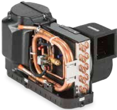
Turbo air conditioner shown with optional sound cover

Powerful, Quiet & Compact With No Drain Pan Worries