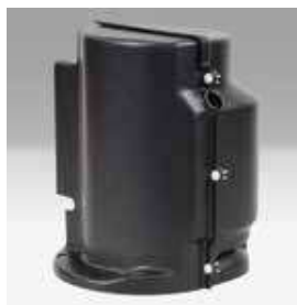
Optional sound cover further reduces compressor noise by up to 50%.