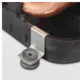
Vibration-isolation mounting clips reduce vibration and noise.