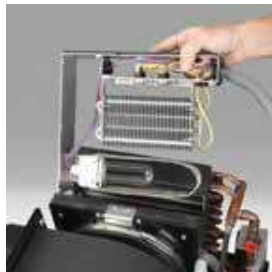
The assembly for the optional electric heater (top) and Breathe Easy air purifier (bottom) fits between the coil and blower (standard AU model shown).