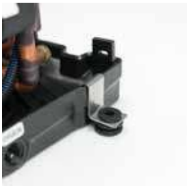
The drain pan features anti-slosh, positive-flow condensate channels, reinforced drain holes, and moveable vibration-isolation mounting clips.

The optional integrated Breathe Easy air purifier is positioned directly in the airstream and uses ultraviolet (UV) light and photocatalytic nano-mesh technology to improve air quality without producing any harmful ozone. The award-winning Breathe Easy eliminates odors and up to 99.9% of VOCs and biological contaminants.