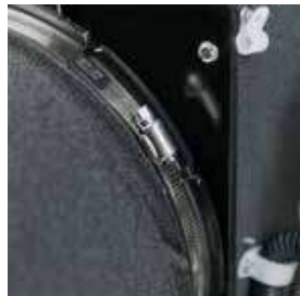
The Gold air handler's HV blower can be easily rotated in the field by loosening the single adjustment screw on the blower collar (standard AU model shown).